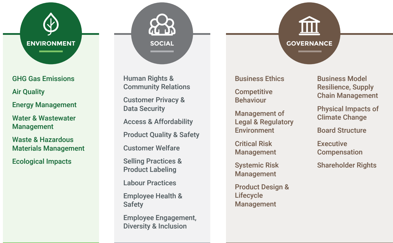
FIGURE 1 | COMMON ESG RATING CRITERIA 2